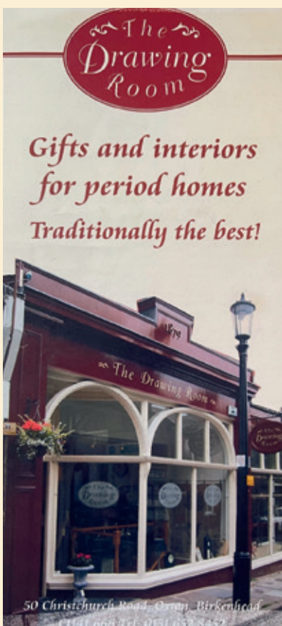
Drawing Room in 2002

I wouldn't exactly call this retirement - more of a gentle transition to a new chapter. Having run the shop mostly on my own for over 22 years, I feel the time is right to ease back a little and explore different opportunities. I'm particularly looking forward to getting involved in some voluntary work and spending more precious time with my family. As for what's next job-wise, I'm keeping an open mind and excited to see what opportunities present themselves!