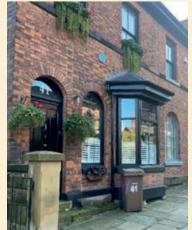
Gillian Mounsey, Chris and Gemma Tutill , 41/43 Christchurch Road. This pair of semis on one of the main entrances to the village have been externally refurbished resulting in a striking improvement to the look of the street.