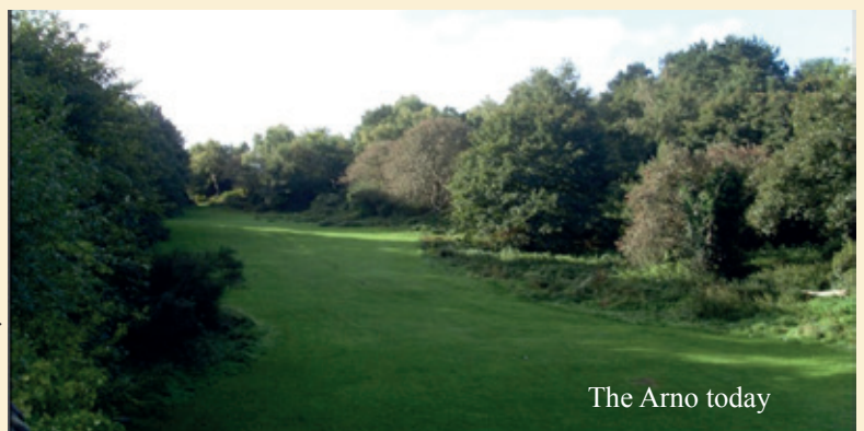
The Arno today